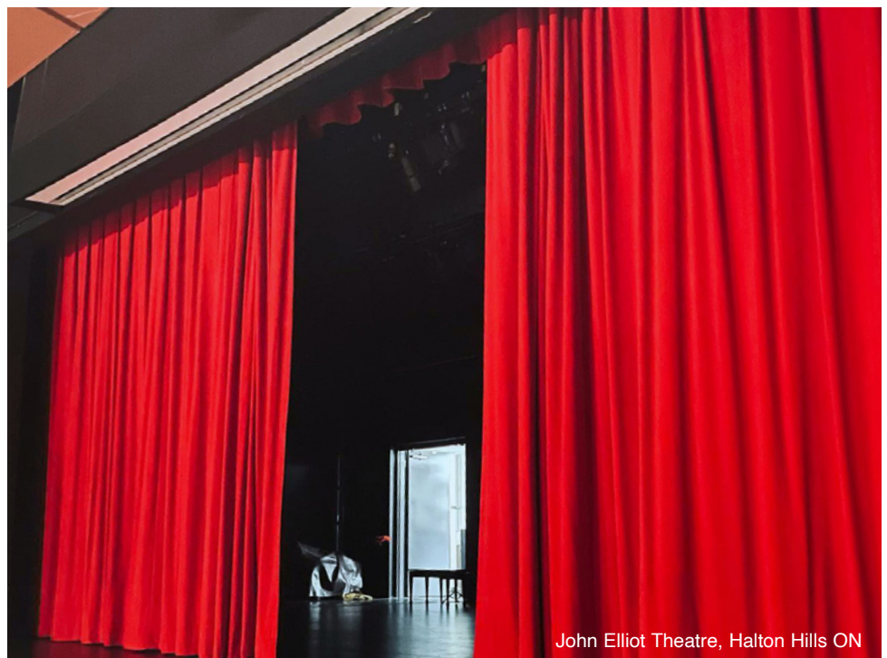
John Elliot Theatre, Halton Hills ON